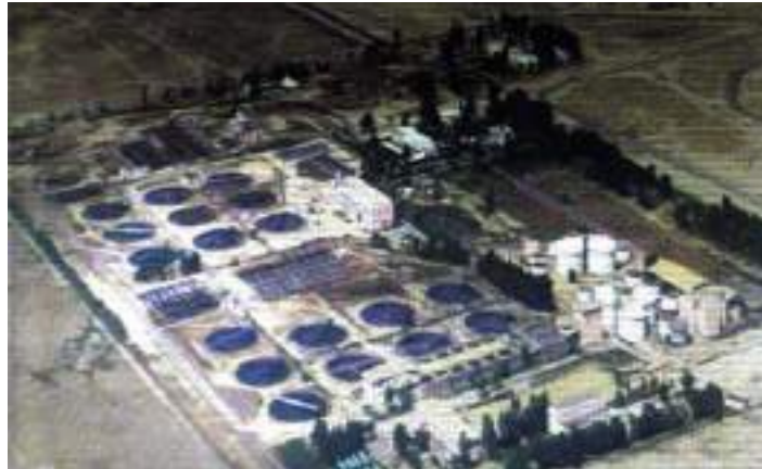
Figure (2) is a picture of the Sulaibiya purification plant

reach 600,000 m 3 /day. Today, after carrying out the expansion works, the plant treats 60% of the total wastewater in the State of Kuwait. [14]