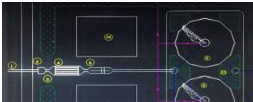
Figure (4) Entrance room (cooling off)

It is placed at the beginning of the treatment works in order to calm the discharge coming from the ejection lines so that the flow system is changed from closed pipes to an open one to move by gravity. [22]