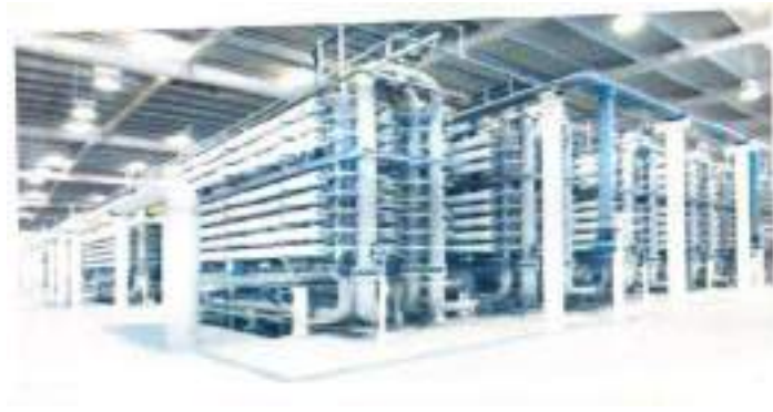
Figure (5) Ultra-fine Filters

[4-5-3] Grass filters (adherent growth) : It usually consists of a circular tank supplied with coarse materials as a medium for the growth of microorganisms, the coarse materials usually used are large size rocks or stones. [21]